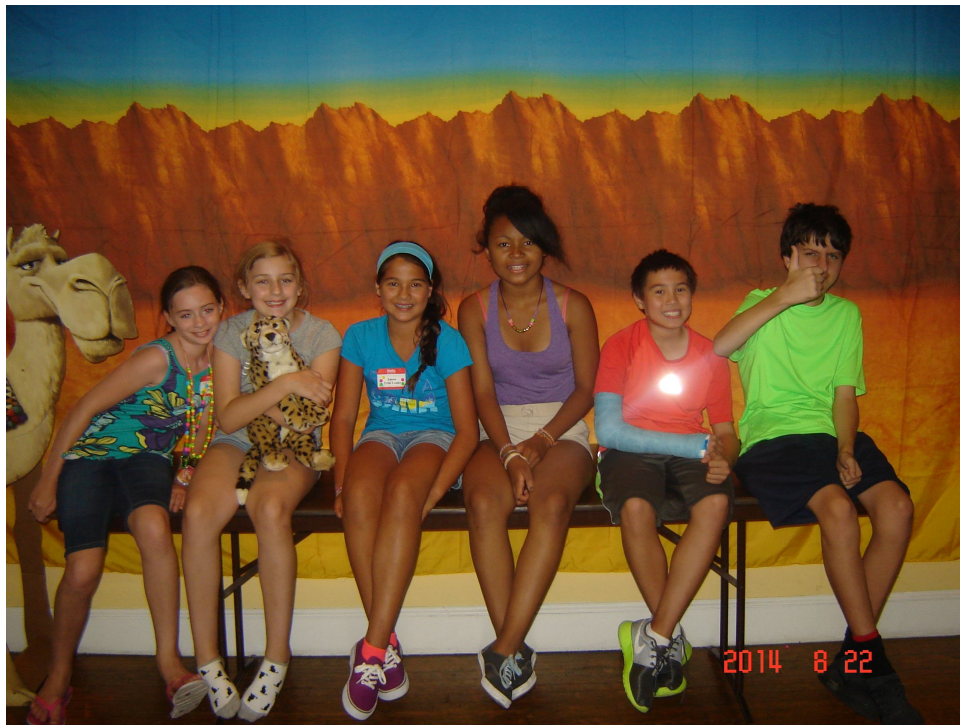
VBS "Tribe Leaders"