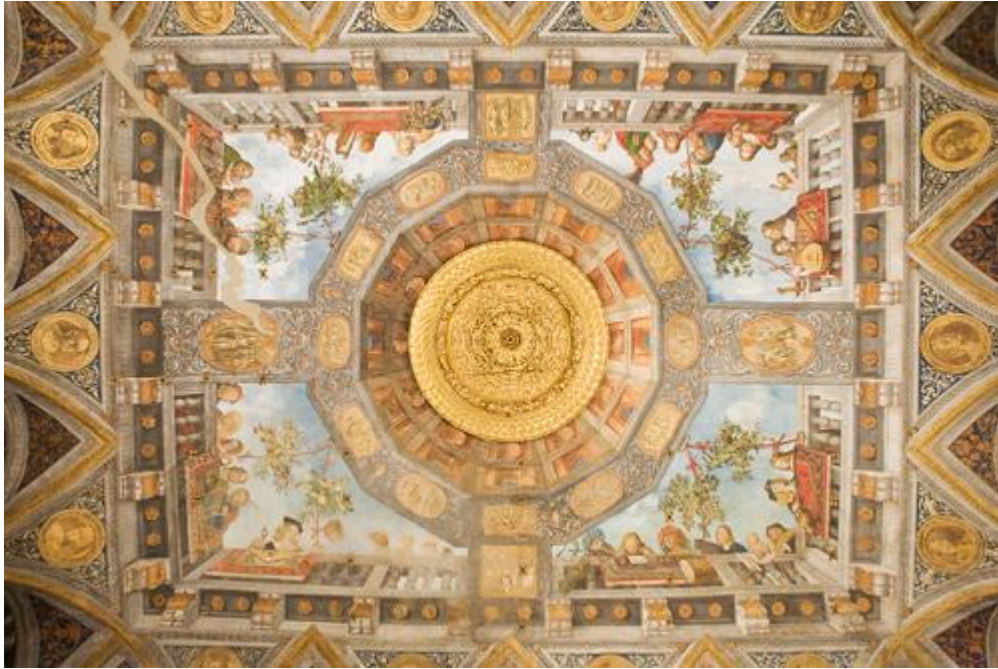
Music room, Palazzo Costabili, Ferraa

17th centuries, who were patrons of a great deal of poets and composers including some which ARTEK has performed - Giaches de Wert and Tasso. We visited the places where they worked and performed in Ferrara - a spectacular (but smallish) performing room with a fabulous painted fresco ceiling, and the prison rooms in the Ferrara Castello - the poet Tasso, who suffered from mental illness, was imprisoned there for years while he wrote his famous epic poem "Gerusalemme Liberata" about the Crusades. A grim place indeed.